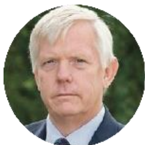
David Fothergill Leader Somerset County Council

'Remember, everyone can catch it, anyone can spread it.'